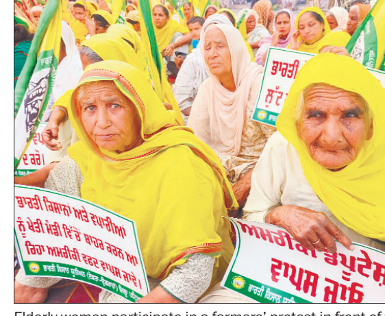
Elderly women participate in a farmers' protest in front of the DC office in Patiala on Friday.

During a protest in Patiala, farmers were holding placards that read "American delegation, go back". Farm-